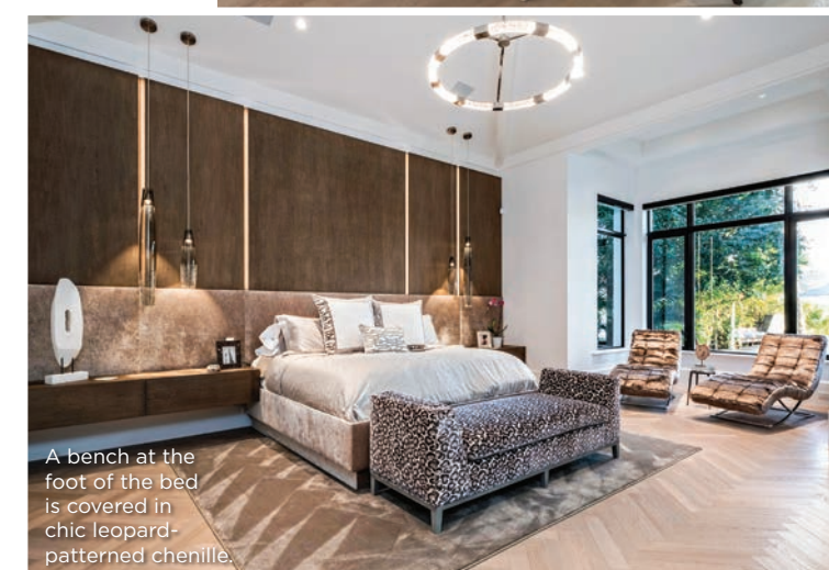
A bench at the foot of the bed is covered in chic leopard-patterned chenille.