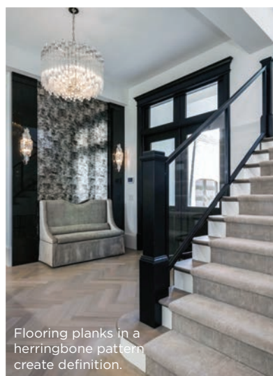
Flooring planks in a herringbone pattern create definition.

To create definition in the foyer, Lalaounis laid flooring in a herringbone pattern. She added minimalistic wood columns and changed the staircase railing from wood to glass. A prism crystal chandelier complements fixtures with similar styling in the dining room and breakfast nook.