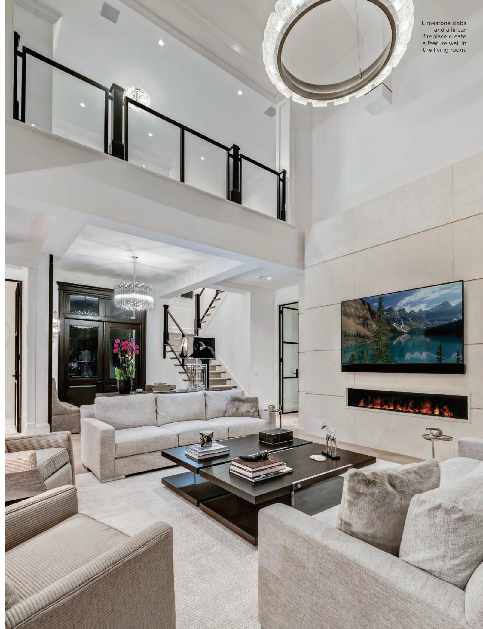
Limestone slabs and a linear fireplace create a feature wall in the living room.

In the dining area, ceiling beams with a walnut finish create architectural detail. A walnut table has a stepped-ledge apron surround, and chairs with gracefully curved walnut frames are upholstered in cream and taupe chenille. Gleaming prism crystals that resemble icicles are mounted in a