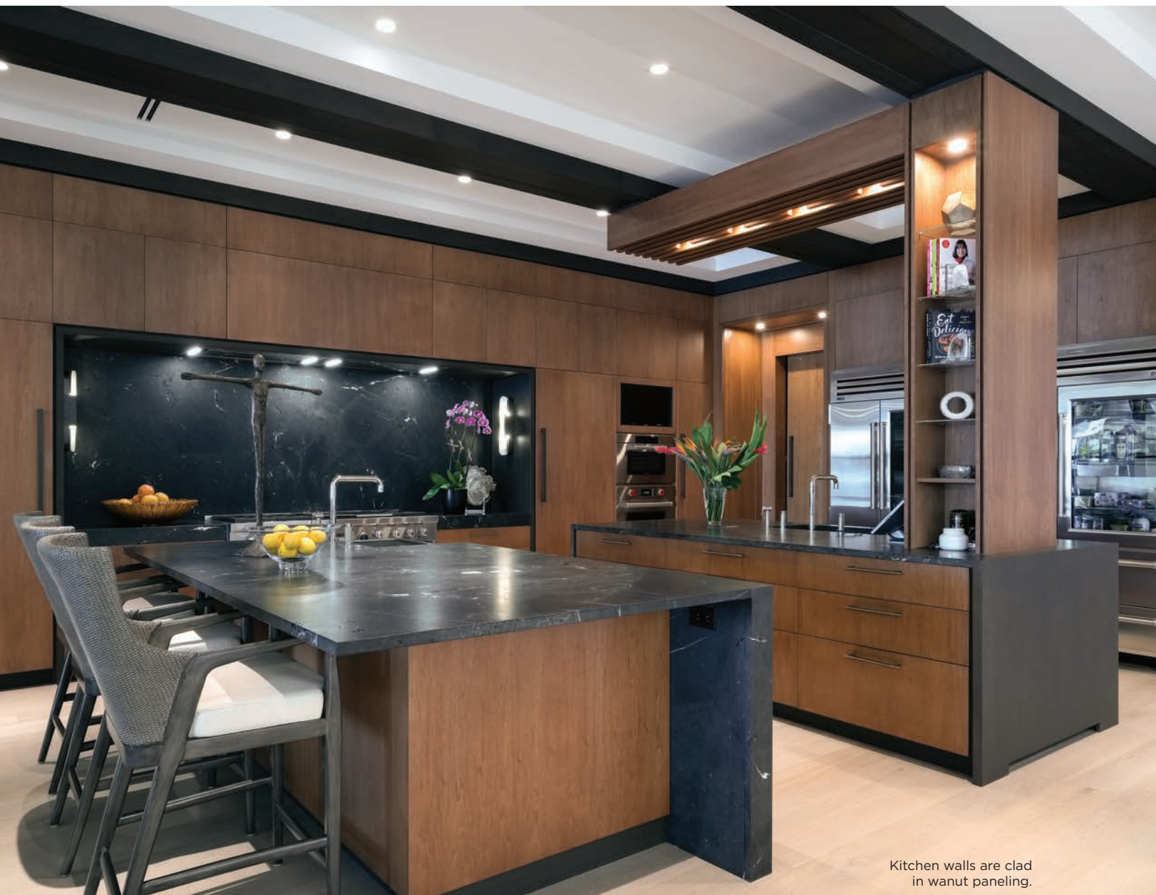
Kitchen walls are clad in walnut paneling.

linear chandelier suspended from a metal canopy, creating continuity with the fixtures in the foyer and breakfast room.