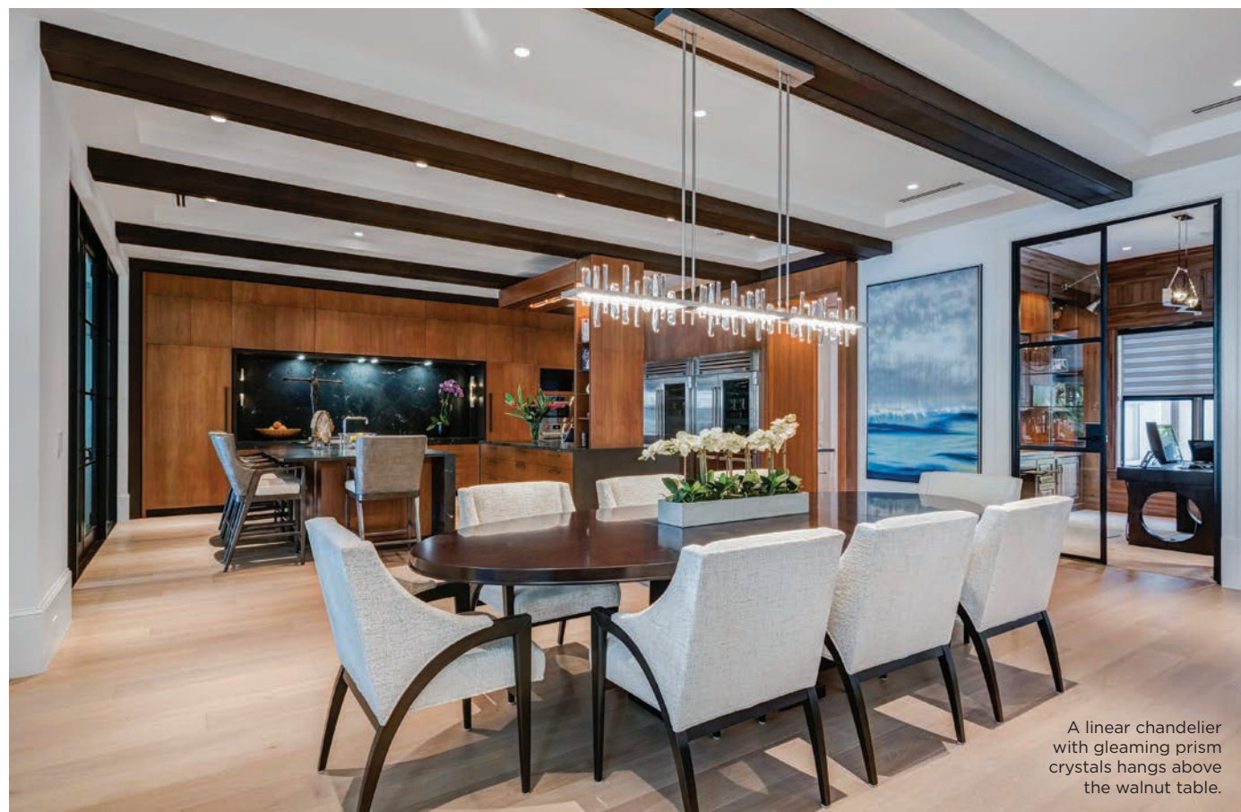
A linear chandelier with gleaming prism crystals hangs above the walnut table.