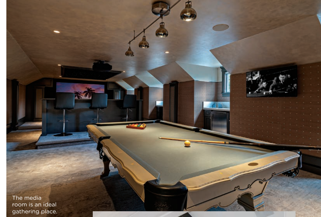
The media room is an ideal gathering place.

Wood, crystal and metals provide a classic look in this home, while a more open floor plan, fresh finishes and stylish new furnishings create living spaces that will bring joy for years to come.